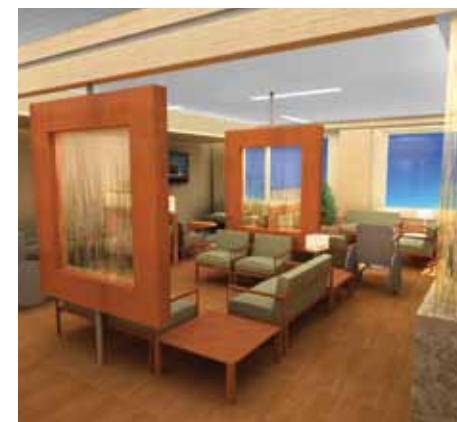
Above right and below left: The sweeping circular drive wraps around a park-like plaza that features stone walls, pathways, multiple tree species and grasses representative of the Bluegrass. Left: Spacious, attractive waiting areas inside the new pavilion are designed for the comfort of family and visitors. Below right: Just inside from the circular drive, the two-story atrium was designed to provide a welcoming experience. It features the warm colors of natural stone and wood, artwork, multiple seating areas, two skylights, extensive glass with views to the outside, and a highly visible information desk.